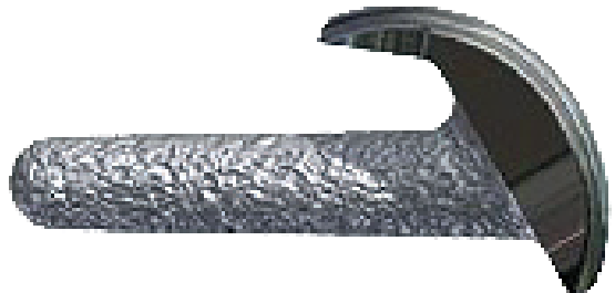
Figure 3: Implant illustrations of the Roto-glide implant, showing the three different components separately, as well as in the assembled position.

It is thought that the Roto-glide design is the only viable design principle that can effectively cope with the toe-off forces that have previously been one of the principal flaws of all fixed