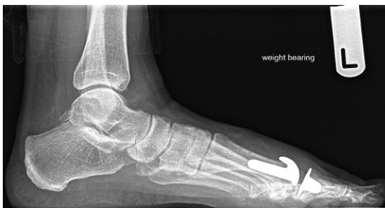
Figure 4: Pre-operative (a) and post-operative (b,c) radiographs of a patient with hallux rigidus, who has undergone arthroplasty with the Roto-glide prosthesis.

the process of compiling mid-term clinical and radiological outcomes of 32 patients; the provisional data is promising with no significant implant-related problems. At present, our mean duration of follow-up is 16.6 months (range 5 to 30 months) post-operatively. One patient developed superficial infection, with prompt resolution following a short course of oral antibiotics. Another patient in our cohort has required revision due to the development of hallux valgus post-operatively. Existing clinical data for this implant has also shown excellent mid- to long-term results [13,19].